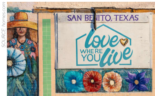
San Benito street mural

"San Benito needs to be rebranded as a cultural, heritage and family oriented place live with many family oriented activities. The downtown district needs help!...I envision complimentary colored facades, renovated buildings and outdoor sitting cafes."