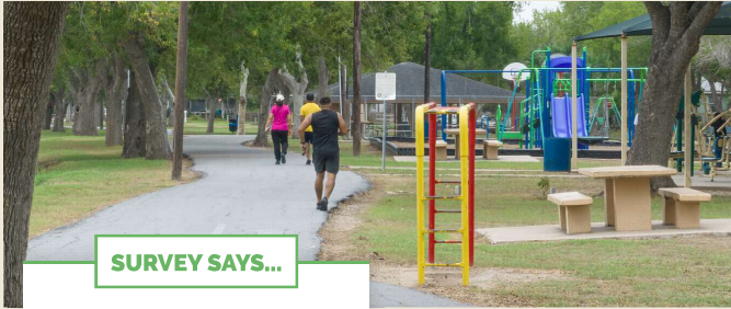
Recreational trail and playground facilities at Heavin Park