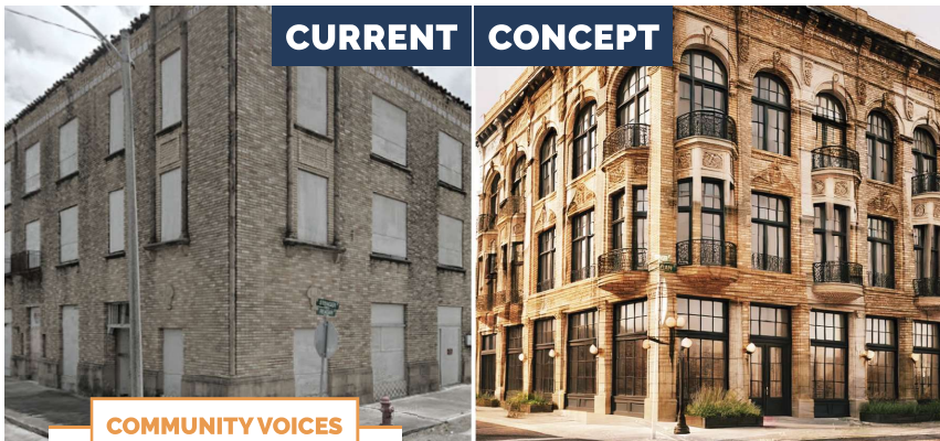
Stonewall Jackson building rehabilitation