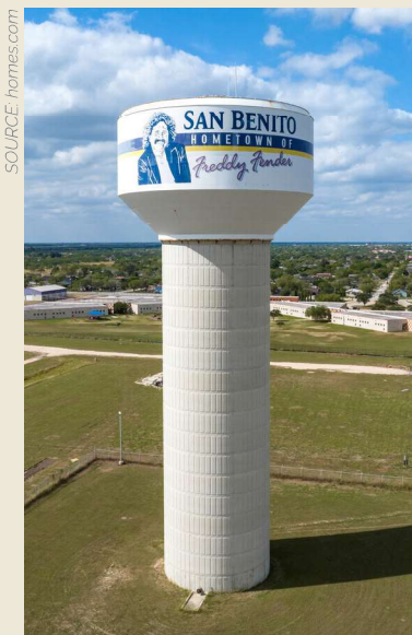
San Benito water tower