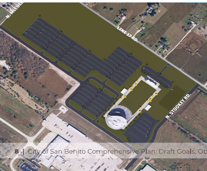
Renderings of proposed Amphitheatre

"Bring more activities for families to do together and have those activities better announced and accessible to everyone."