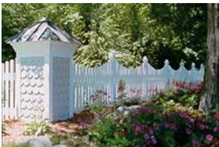
Concave picket fence