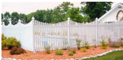
Concave picket fence