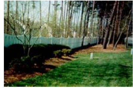
Concave shadow box vinyl fence

Vinyl fences made from PVC will provide years of maintenance-free service. Vinyl fences come in a variety of shapes and patterns, from picket fences and basket weaves to shadow box and several full privacy selections.