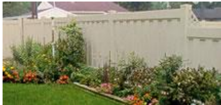
Tan vinyl privacy fence

Vinyl fences come in a variety of styles.