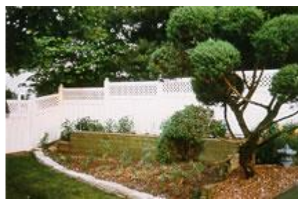
Vinyl privacy fence with lattice