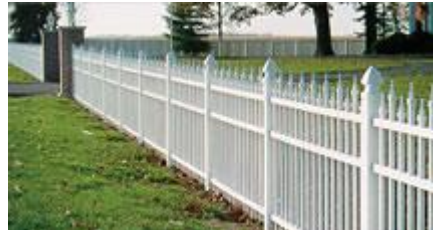
Perimeter vinyl fence