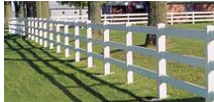
3 rail vinyl fence